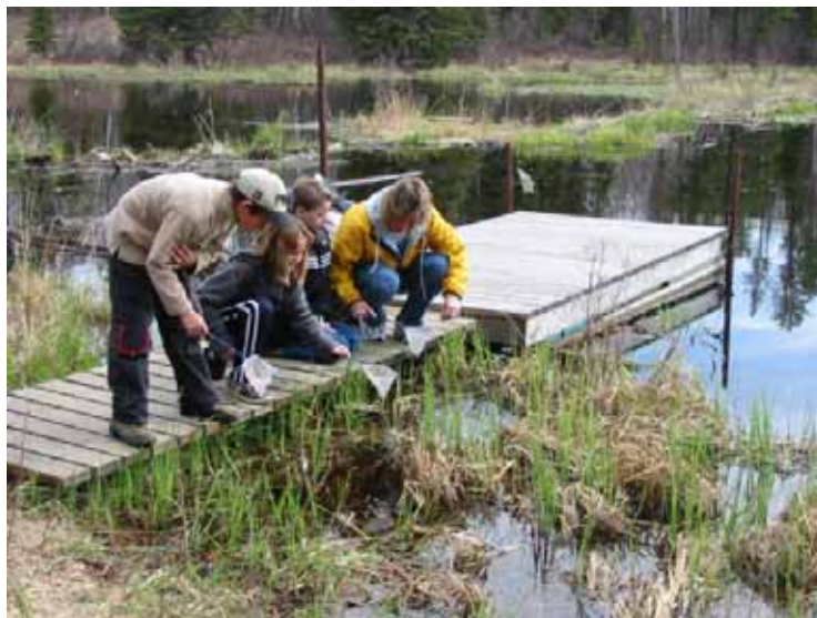
Students try their hand at "critter dipping".

For more information about the DU Adopt-A-Class program visit: www.ducks.ca