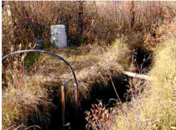
Typical small FORWARD stream with Isco sampler.

The Forest Watershed and Riparian Disturbance (FORWARD) project was initiated based on an interest on the part of forest companies, including Louisiana-Pacific Canada Ltd., to link forest management practices with scientifically-based watershed management. Since the project was formalized in 2001, it has developed into a partnership between scientists from three Canadian universities (Lakehead University, University of Alberta and University of Saskatchewan), government, and several other stakeholders. The goal of the