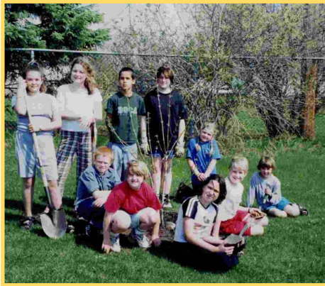
Elementary school students taking part in Annual Arbour Day Events.

The key activities for this volunteer group include: tree nursery management, Annual Arbour Day Events, care for newly planted trees (watering and pruning), establishing the Arboretum, Dutch Elm surveillance, and promoting a green environment for living trees in the community. Each year in early May the committee promotes "Arbour Day", where volunteers come together and plant up to 200 shade trees in the community.