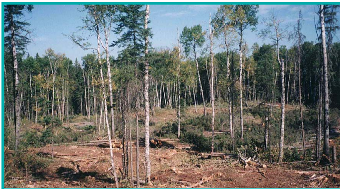
Modified retention clearcut silviculture system.

The seed tree silviculture system retains scattered mature standing trees throughout the cut-block to provide a seed source for natural regeneration. LP typically leaves conifer seed trees singly or in clumps and incorporates them into wildlife leave patches/areas. This system results in retained trees that are more wind firm. The seed tree system is typically prescribed for the aspen/white spruce mixedwood stands.