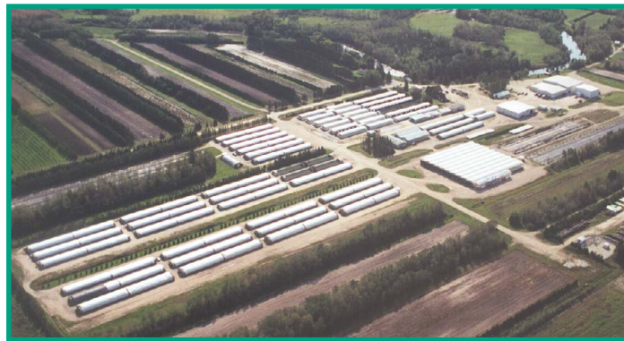
Aerial view of the Pineland Forest Nursery.

LP works closely with the 20 core staff at Pineland to ensure that the seedlings meet required specifications and are ready to be planted each spring and summer.