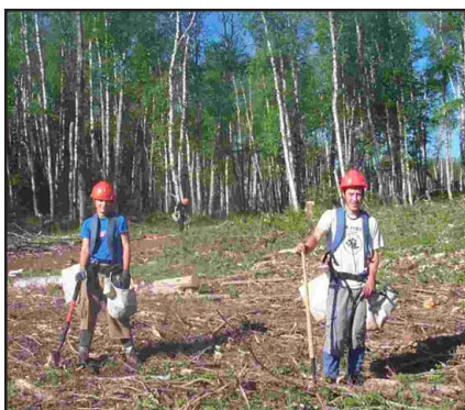
Tree planters planting a cutover.

Welcome to the forest renewal newsletter. Forest renewal is one of the components of silviculture. Silviculture is the science and practice of controlling the establishment, composition, growth, health and quality of forests. This issue describes the steps involved in renewing the forest after harvesting including the systems used and where our seedlings are grown, as well as highlights of the Swan River urban forest committee.