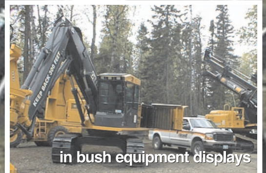
in bush equipment displays