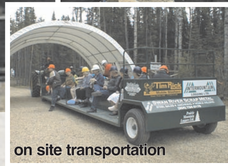
on site transportation