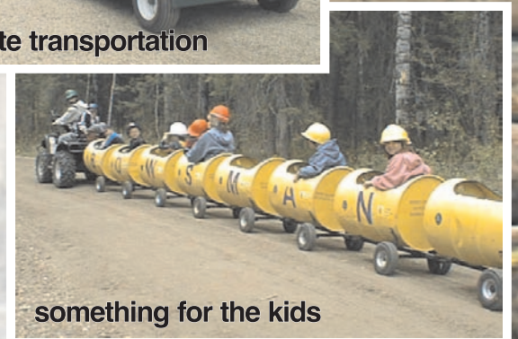
something for the kids